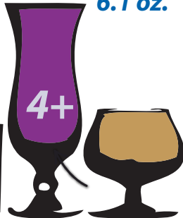
Long Island Iced Tea 6.1 oz.